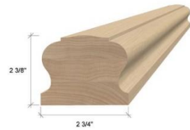
High Profile "B"